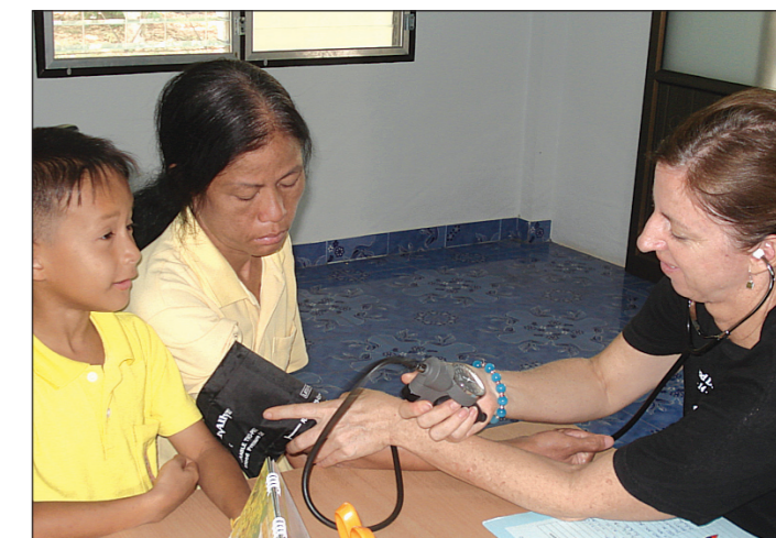
Mother and child attending the Friday clinic

yet diagnosed but arrive sick, debilitated and in urgent need of medical care. A 32 year old local gentleman who had been working in Bangkok for some years arrived at our clinic, he had HIV/AIDS but said he did not need to